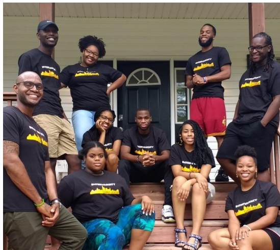
InterVarsity Student Leaders from various campuses in the Jackson, Ms. area